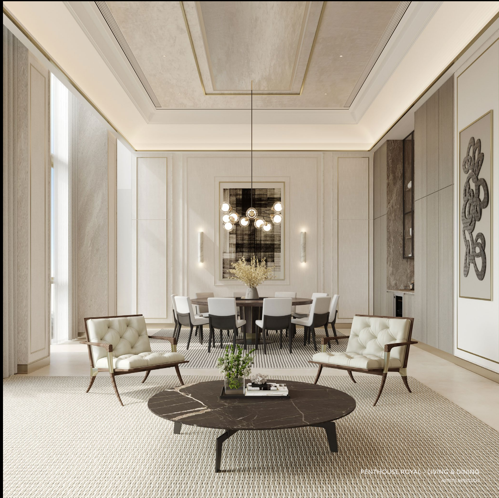
PENTHOUSE ROYAL - LIVING & DINING ARTISTIC IMPRESSION