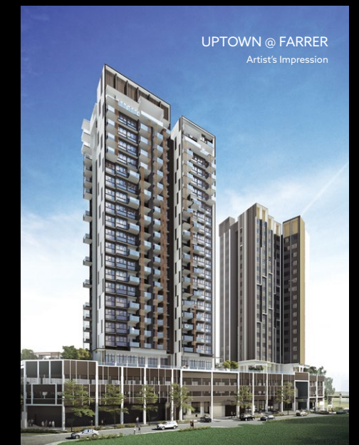
UPTOWN @ FARRER Artist's Impression