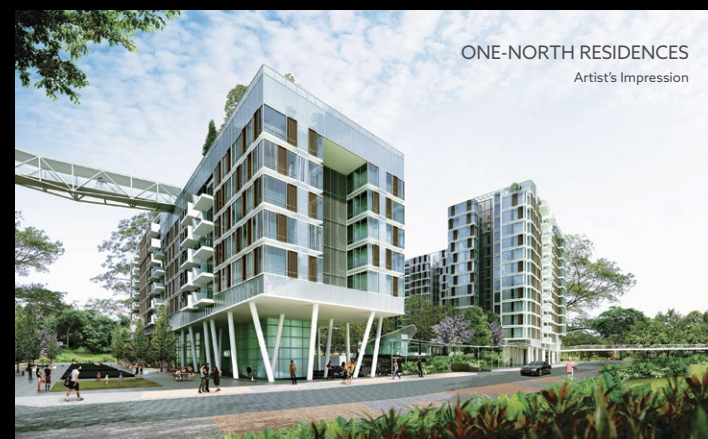
ONE-NORTH RESIDENCES Artist's Impression

Low Keng Huat (Singapore) Limited ("LKHS") is a builder established since 1969. Today its business has grown to encompass property development, investments and hotels. Major development projects include Duchess Residences, One North Residences, Kismis Residences, Parkland Residences, The Minton, Uptown @ Farrer and Paya Lebar Square. Its main investment properties include retail malls at Paya Lebar Square and BT Centre in Singapore. It focuses on constructing in-house development and investment projects. LKHS owns and operates deluxe hotel in Perth (Australia) under the in-house brand Duxton Hotel. In addition LKHS owns serviced apartments in Singapore, Citadines Balestier and Lyf @ Farrer, and both are operated and managed by The Ascott Group. Its other hospitality related business in Singapore is the food and beverage business under our in-house brand name Carnivore.