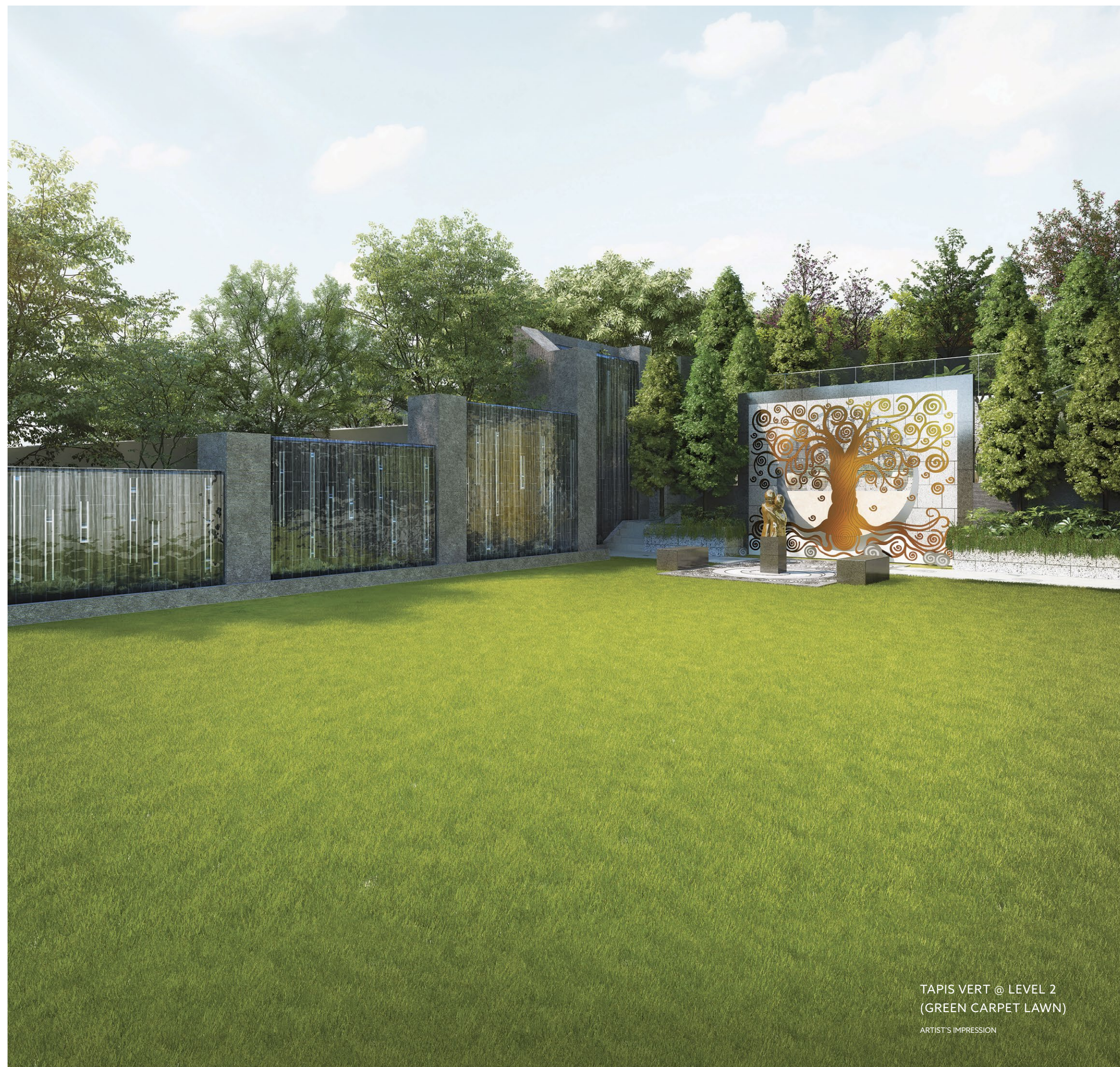
TAPIS VERT @ LEVEL 2 (GREEN CARPET LAWN) ARTIST'S IMPRESSION

Celebrate the luxury and joy of outdoor living at home.