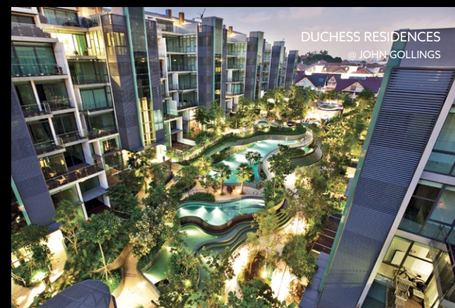
DUCHESS RESIDENCES