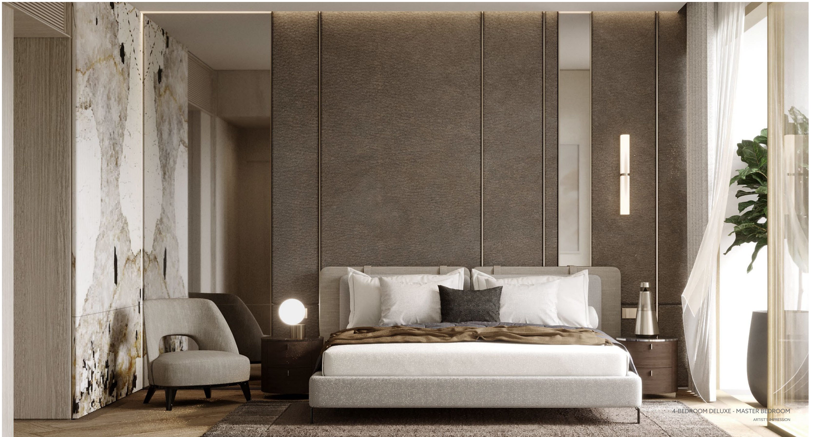
4-BEDROOM DELUXE - MASTER BEDROOM ARTIST'S IMPRESSION

Not forgetting its own view of the world outside.