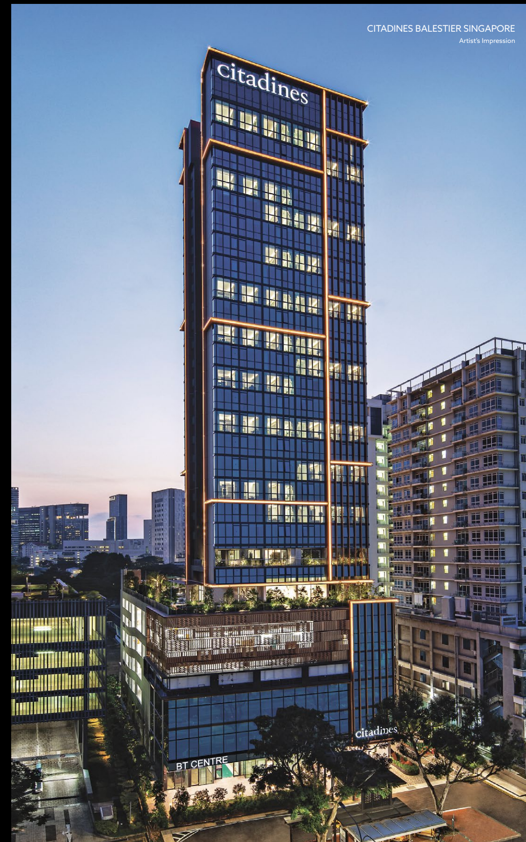
CITADINES BALESTIER SINGAPORE Artist's Impression