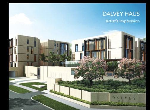
DALVEY HAUS Artist's Impression